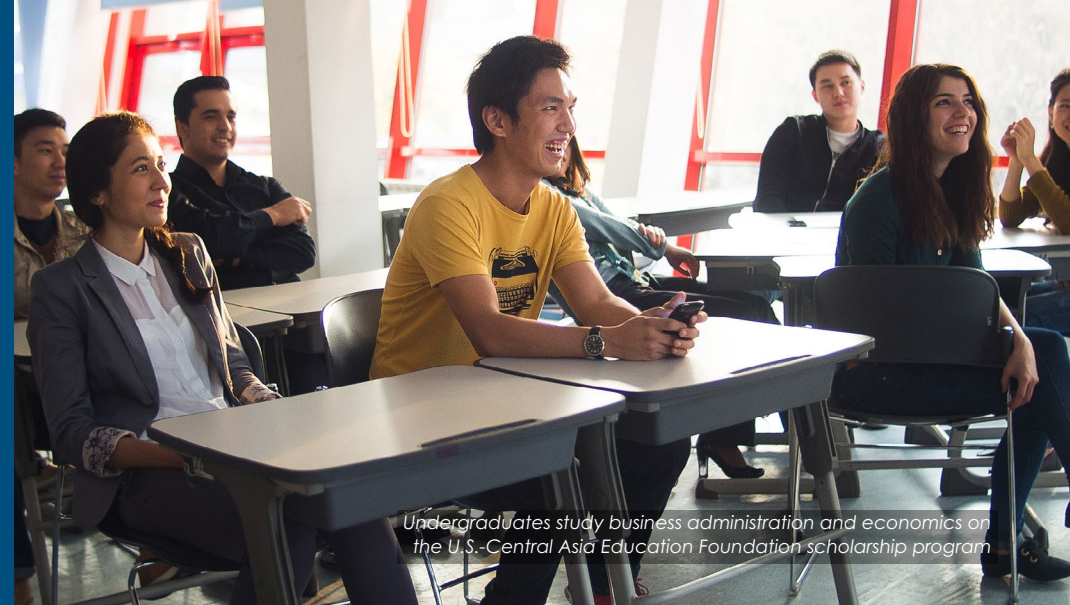
Undergraduates study business administration and economics on the U.S.-Central Asia Education Foundation scholarship program

for International Education is a premier, international nonprofit creating educational opportunities that prepare individuals and institutions to succeed in our interconnected world. Being immersed in other countries and cultures enables individuals to grow personally and professionally while empowering them to address – and solve – the world's most complex political, economic, and social challenges.