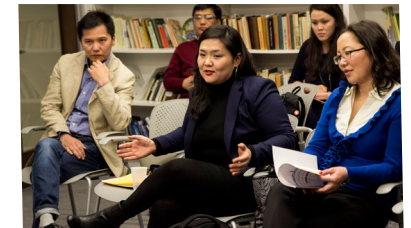
Mongolian journalists in Washington, D.C. discuss the U.S. media culture

Recognized as the “gold standard” in our field, American Councils has received over half a billion dollars in competitive grant awards from government agencies and charitable foundations. American Councils is a trusted recipient of funding from sources including the U.S. Department of State, the U.S. Department of Education, Library of Congress, National Endowment for Humanities, USAID, U.S. embassies around the world, Rockefeller Brothers Fund, the John D. and Catherine T. MacArthur Foundation, World Bank, Open Society Foundations, the U.S.-Russia Foundation, and many foreign governments and their ministries of education.