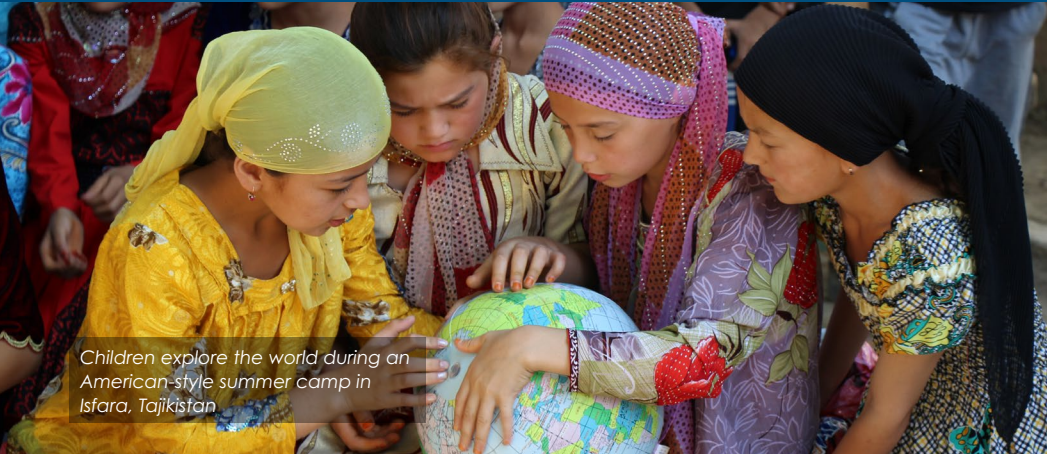
Children explore the world during an American-style summer camp in Isfara, Tajikistan