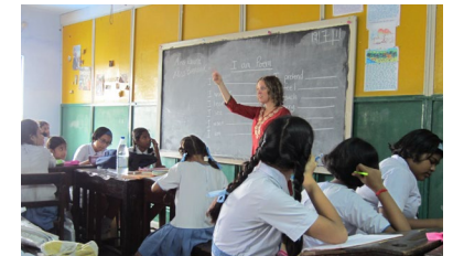
A visiting American teacher instructs her students in India