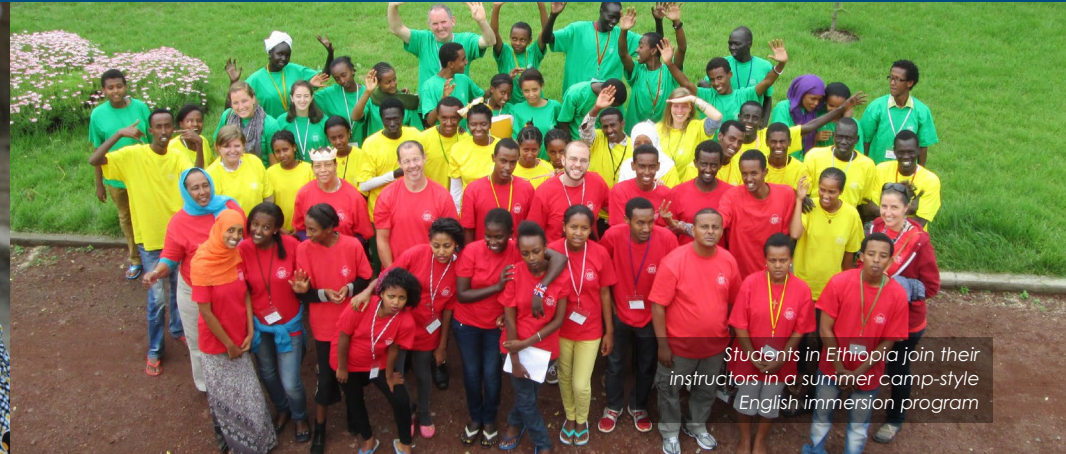
Students in Ethiopia join their instructors in a summer camp-style English immersion program