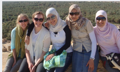
U.S. undergrad participants study Arabic language and culture in Egypt