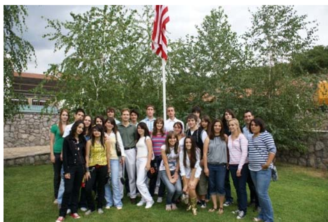
A-SMYLE recruits and alumni pose with the US Ambassador to Montenegro.