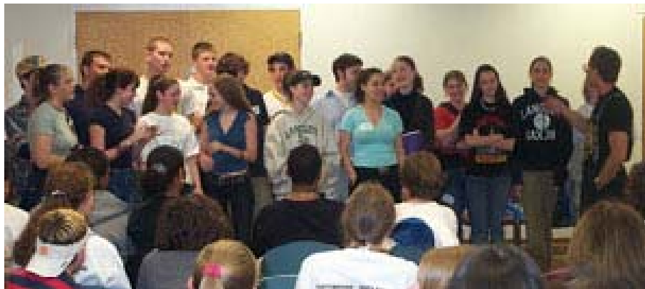
Langley (VA) H. S. students sing Russian folk songs while waiting for scores.