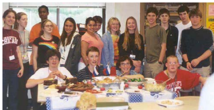
The 2004 Indiana/Illinois participants relax.