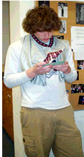
One student is still studying 30 seconds before his summons.