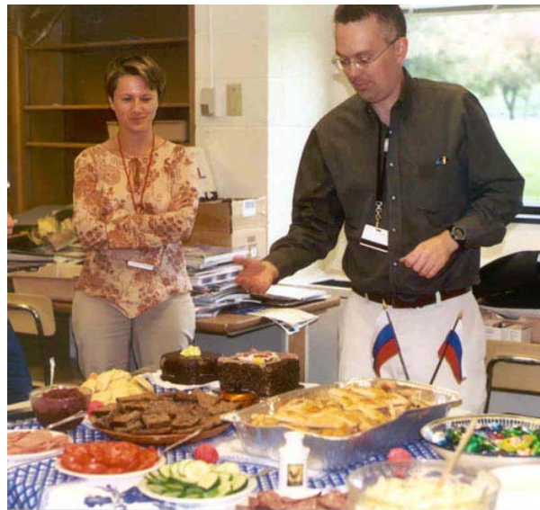
Olympiada teachers nervously await their students' scores.