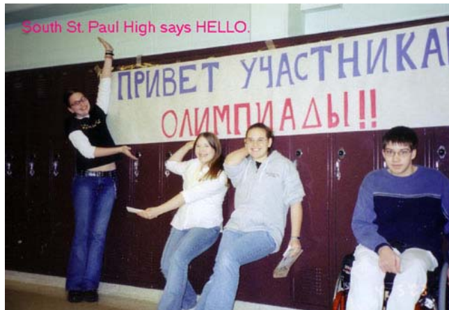
South St. Paul HS students greet participants from other schools