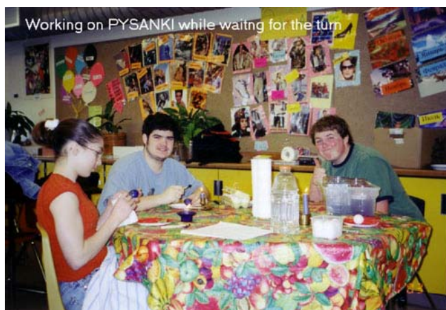
Students relax after the last Commission by decorating “pisanki”.